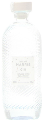
ISLE OF HARRIS STYLE: GIN REGION: SCOTLAND (OUTER HEBRIDES) ABV: 45%