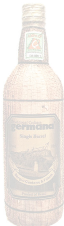
GERMANA SINGLE BARREL STYLE: CACHAÇA REGION: BRAZIL ABV: 41%

This collaboration begins life in Scotland as a blend of thirty malts and grains married in ex-Oloroso casks, before being transferred to the bodegas of Jerez for a final maturation in ex-Pedro Ximénez casks, the darkest, thickest and sweetest of sherry wines. The result is a surprisingly delicate whisky of finesse, yet one so thoroughly couched in sherry it is more akin to a whisky liqueur. This much sweetness can be polarising, but for those who prefer their dessert in a glass, this makes an elegant close to a leisurely meal.