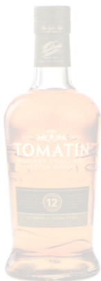
TOMATIN 12 YEAR OLD STYLE: SINGLE MALT WHISKY REGION: SCOTLAND (HIGHLANDS) ABV: 43%

Yet another gin that skates on the edge of quirky – what else do you expect from a distillery called The Subversives? Nosing like a forest floor of mushroom, mulch and moss, this little piggy is reminiscent of an Old Tom Gin with an earthy, farmyard sweetness courtesy of parsnips. It makes for an adventure on the palate when you want a cocktail that goes off-piste, or just looking to add a third dimension to your G&T. Weird but we like: kudos for stepping up to the line, without actually crossing it.