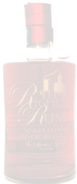
RICHLAND RUM STYLE: RUM REGION: USA ABV: 43%

Full disclosure: we count these brothers as friends, and look forward to great whisky from the Dornoch distillery. But their first product is a tour de force, an imaginative and moreish gin infused with freeze dried raspberries, before being blended with a small portion of new make spirit double distilled from floor malted heritage barley. The nose alone could lead a horse to drink, but it's the palate that truly comes alive with fresh citrus, conifer and a berry sweetness that begs you to spare the tonic and ice. Swipe right, natch!