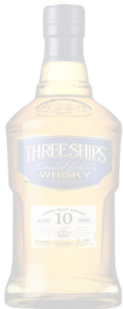
THREE SHIPS 10 YEAR OLD STYLE: SINGLE MALT WHISKY REGION: SOUTH AFRICA ABV: 44.6%