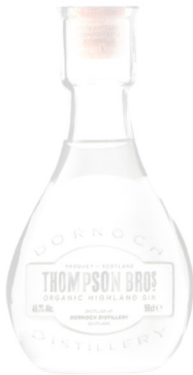
THOMPSON BROS ORGANIC GIN STYLE: GIN REGION: SCOTLAND (HIGHLANDS) ABV: 45.7%

Those who enjoy blind tastings will have fun nosing this savoury spirit reminiscent of a rich beef stock with lashing of Lee & Perrins, only to have it pivot 180° on a palate so minty and fresh you'll reach for a julep cup. It is one of the many joys to be had exploring premium cachaça, a species rarely seen outside Brazil, making this single barrel a welcome balm for those who appreciate the bass-like funk of distilled cane. Meant for sipping, not mixing, but go ahead and use in your caiparinha – if you must.