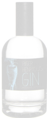
PIGER HENRICUS STYLE: GIN REGION: CANADA ABV: 43%