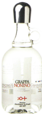
GRAPPA NONINO STYLE: GRAPPA REGION: ITALY (FRIULI) ABV: 43%