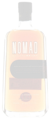
NOMAD OUTLAND WHISKY STYLE: BLENDED WHISKY REGION: SPAIN ABV: 41.3%