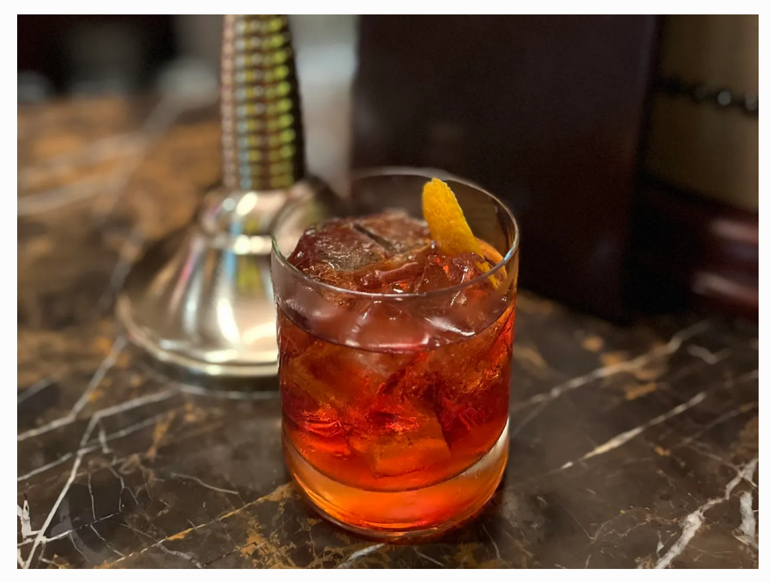
Crystal Signature Negroni at Avenue Saloon onboard the newly-relaunched Crystal (formerly Crystal ... [+] CRYSTAL

At Avenue Saloon onboard the newly-relaunched Crystal (formerly Crystal Cruises), there's Negroni Collection menu. The Crystal Signature Negroni Cocktail features Thomas Dakin Gin, coffeeinfused Campari Bitter, Cocchi Vermouth and a dash of chocolate bitter. Vice President of Food & Beverage Operations, Günter Lorenz says: "The Crystal Signature Negroni cocktail is both bittersweet and complex. As the name suggests, it is based on a classic Negroni, but with coffee infused complexity and a dash of chocolate bitter. It is perfect for an Aperitif or Digestif."