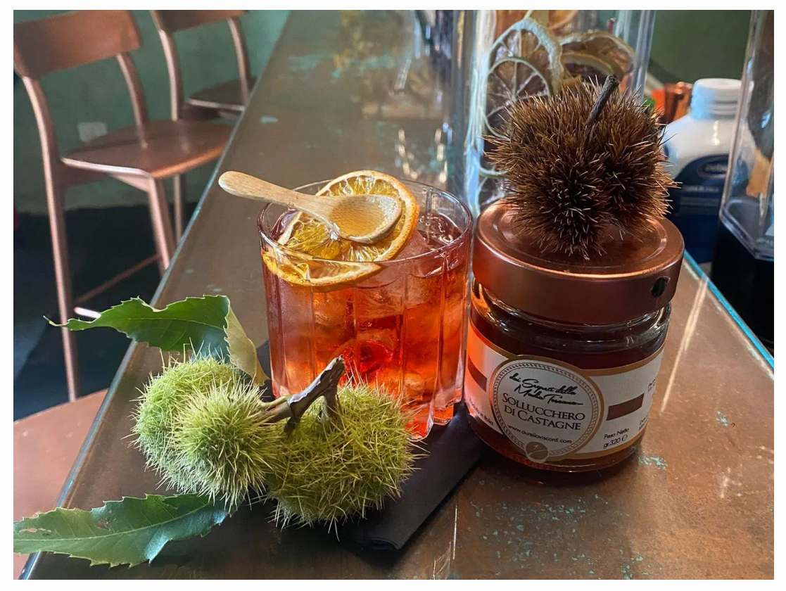
Castagne (Chestnut) Negroni at Monteverdi Tuscany. MONTEVERDI TUSCANY.