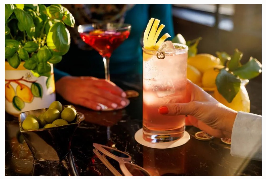
Limoncello Negroni at Il Giardino Bar at Hotel Eden in Rome.